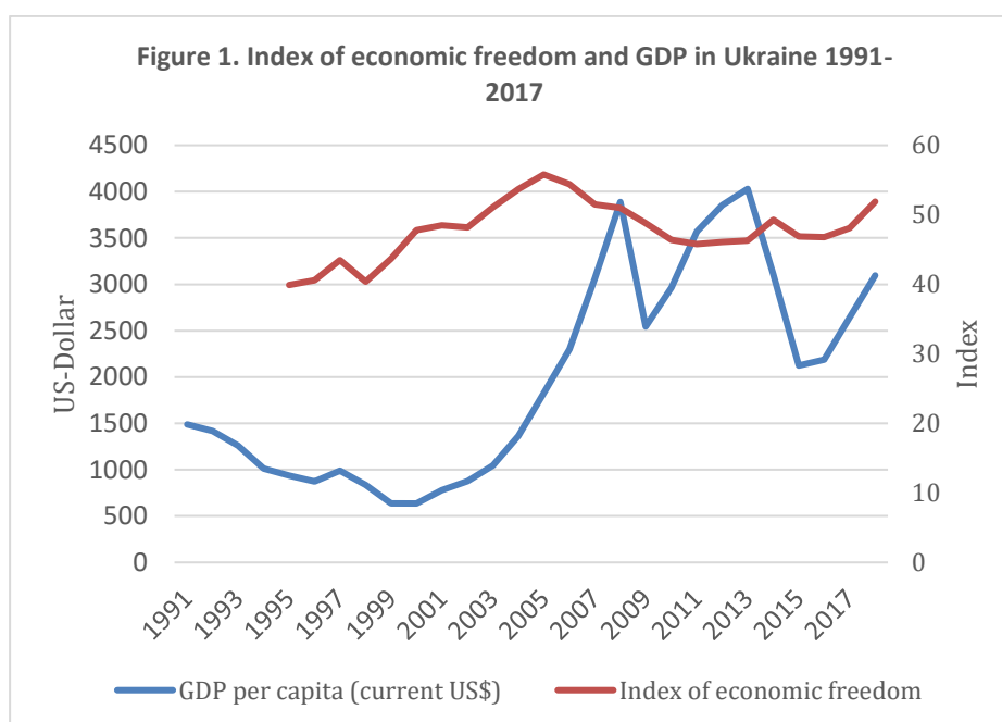
Figure 1. Index of economic freedom and GDP in Ukraine in 1997-2017

index of economic freedom (See Figure 1). GDP shrank by 16% in the two-year period from early 2014 to late 2015, while inflation surged, reaching a peak of 61% in April 2015, the exchange rate weakened, and the terms of trade deteriorated. The crisis of 2014-15 emphasized a number of institutions inherent in the Ukrainian economy (OECD, 2018). The dramatic depreciation of the hryvnia had a devastating effect on the balance sheet of enterprises. Following the latest updates of the overall situation in Ukraine, that country has overcome the heavy crisis caused by armed conflict in the eastern part of the country. At the same time, a 200 per cent devaluation of Ukrainian national currency (hryvnia) in 2014-2015 made Ukrainian goods and services cheaper and more competitive.