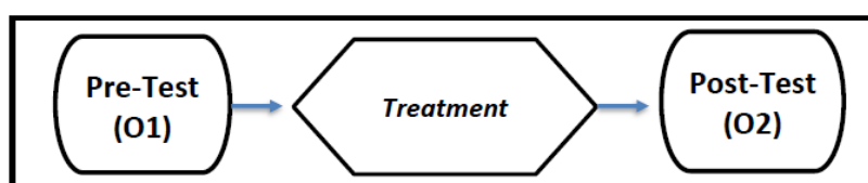
Figure 1. Type of One-group pretest-posttest design Sugiyono (2019)

The research method used was experimental research. According to Sugiyono (2019) the experimental research method is a quantitative method used to determine the effect of the independent variable (treatment) on the dependent variable (result) under controlled conditions. While the type of experimental research applied in the field was the One-group pretest-posttest design. This type of research was conducted by one group of subjects by giving a pre-test followed by giving treatment and given a post-test to determine the effect of the treatment by comparing the pre-test and post-test values. An overview of this type of research can be seen in the chart below.