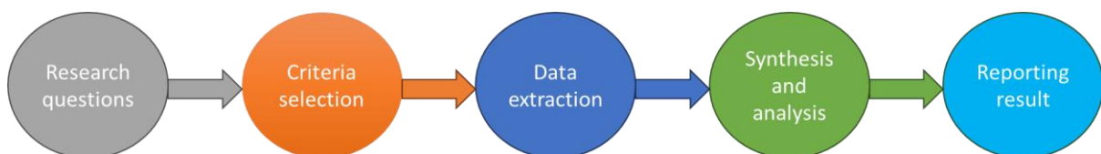
Figure 1. Research methodology for the present systematic literature review

The methodological framework was based on an iterative process of gathering and analyzing literature. The comprehensive search included databases such as Google Scholar, Web of Science, and academic journals, focusing on articles published between 2019 and 2023. The inclusion criteria were publications that discussed digital transformation within the context of business process management, with a particular focus on sustainability and corporate governance. To do this, we used the following methodology for the study of this systematic literature review Figure 1.